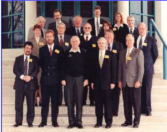
Russia Workshop Authors with Army War College Commandant, Major General Robert H. Scales, Jr.

believe that Russia's voice must be heard in every international forum and on every key international issue. Russian leaders appear to be prepared to dedicate significant treasure to rebuilding military forces appropriate to that perceived status. This course, however, fails to address the underlying economic and environmental problems that are impeding Russia's economic development and that are, quite literally when it comes to the country's environmental problems, killing them. If Russian leaders continue to regard military power as the key indicator of Russia's standing, the required investment will absorb resources needed to rectify these problems. As a result, they will lead Russia further down a blind alley, en-